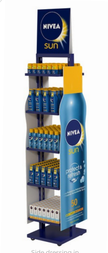
Side dressing in Dispa Side-by-side shelves