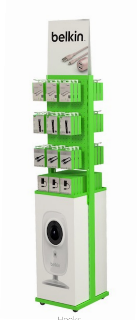
Hooks Cladding in forex